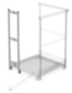
Order no.: 060957 Railing element