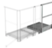
Order no.: 060951 Extension platform 1000 x 1000 mm