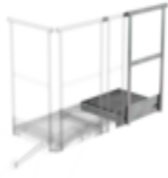
Order no.: 060943 Extension platform 800 x 800 mm