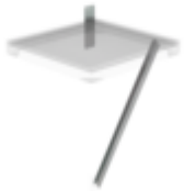
Order no.: 060953 Flange plate and struts for brick masonry, depth: 1,000 mm