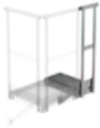
Order no.: 060941 Extension platform 400 x 800 mm