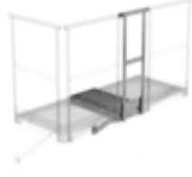
Order no.: 060952 Extension platform 500 x 1000 mm