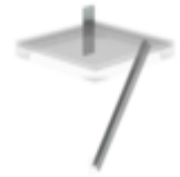
Order no.: 060954 Flange plate and struts for brick masonry, depth 800 mm