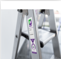
Order no.: 019176 Inventory sticker